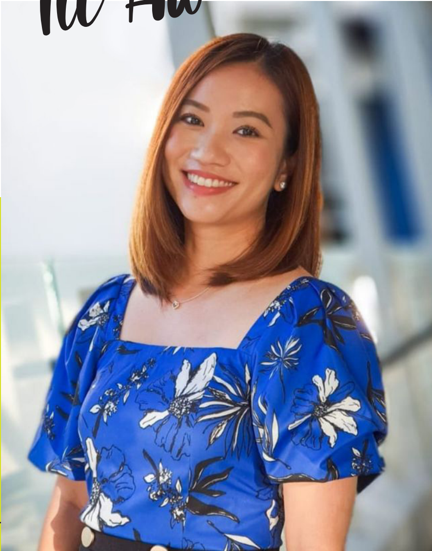
Work-Study Certificate in Digital Marketing & Branding